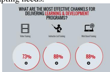
Figure.1. Importance of Digital Learning

Digital Learning can empower students to handle ideas all the more rapidly and completely, to associate hypothesis and application all the more capably, and to participate in adapting all the more promptly, while additionally enhancing instructional systems, utilizing teacher time, and encouraging the across the board sharing of information. Computerized latest moderns will empower this in new and better ways and make conceivable outcomes past the cutoff points of our present creative ability. Educational modules, direction, appraisal were the three key segments of instructing and adapting, so they are additionally key to advanced learning. The latest modern tools give access to information and assets so instructors can utilize evaluations to individualize guideline in ways that are unrealistic without the mechanical tools. This may include particular programming that evaluates students and conveys direction coordinated to their adapting needs.